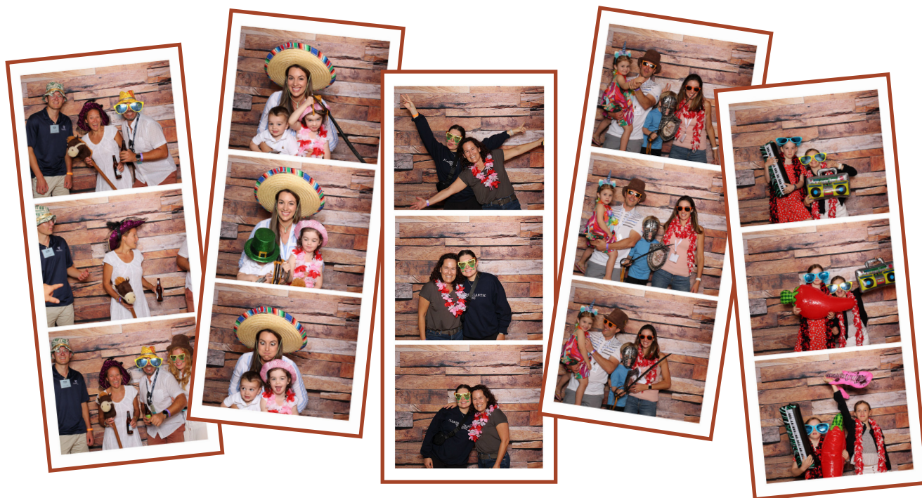
Photo Booth At Friday Night's Reception

Here is a fun opportunity—we will have a photo booth. Capture creative, unique, and amazing experiences as our guests pose for the camera. The pictures will have your logo embedded as a souvenir for them to take. You are welcome to bring your own props or use the photographers.